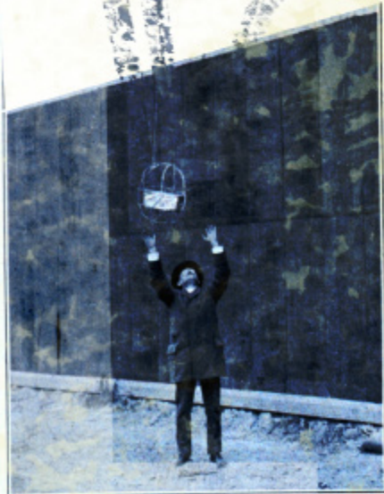
FIG. 3. LAUNCHING BALLON-SONDE